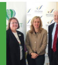
National Diabetes Week