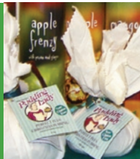
Christmas Puddings, Logs and Fruit Fusions