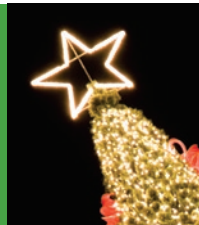
Chief Minister's 'Lighting of the Christmas Tree'