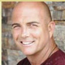
JAMES BLUNDELL Singer/Songwriter