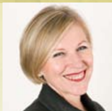
ONDINA Owner Ondina Studio, Kingston